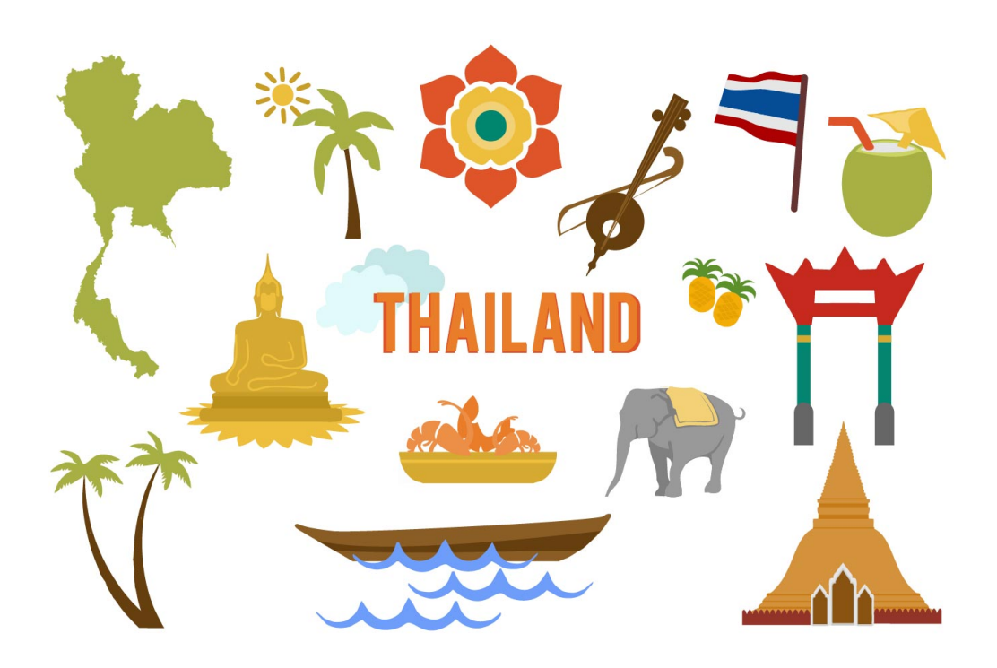
"It is better to travel well than to arrive." The Buddha